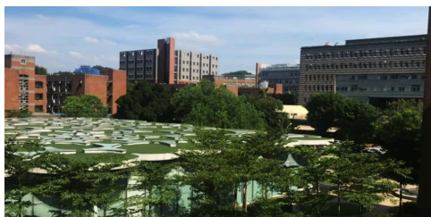
Day in the Life of an Exchange Student in Taiwan // National Taiwan University (NTU) | 2020