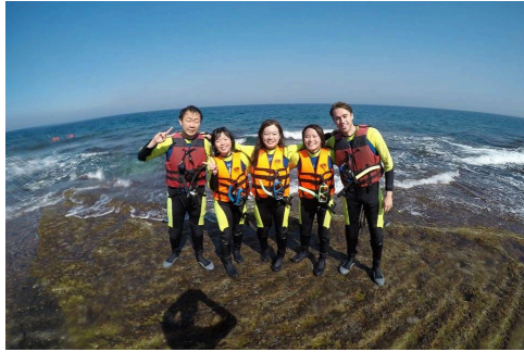
Top 5 Reasons to Study Abroad in Taiwan | 2020