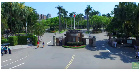
2018 National Taiwan University (Full Version) - NTU Campus