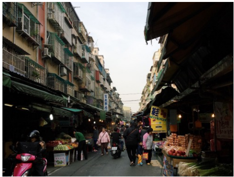
Berkeley Student at National Taiwan University | 2014