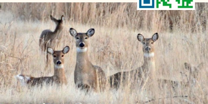
Harvesting antlerless deer is crucial to success.