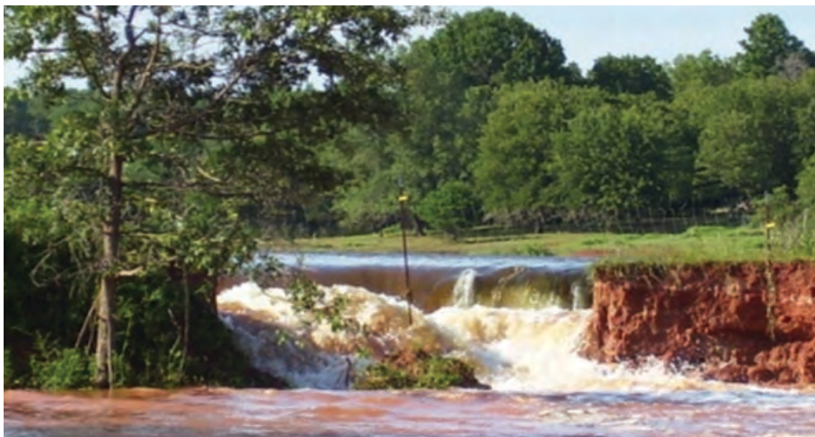
Dam Failure resulting in a sudden uncontrolled release of water

Emergency Level 1: This is a slowly developing non-emergency event. The situation does not threaten the operation or structural integrity of the dam, but may potentially do so if it continues to develop. Dam technical representatives or state dam safety officials should be contacted to investigate the situation and recommend actions to the dam owner. The condition of the dam should be closely monitored, especially during storm events, to detect any worsening of the dam’s condition.